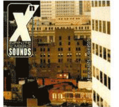
Infinite Number of Sounds Time Wants a Skeleton Self-Released

Infinite Number of Sounds' surrealistic approach to music is likely to gain them notoriety in the underground, paving the way for further aural art experimentation, and perhaps even crafting a new genre -- Musica Obscura .